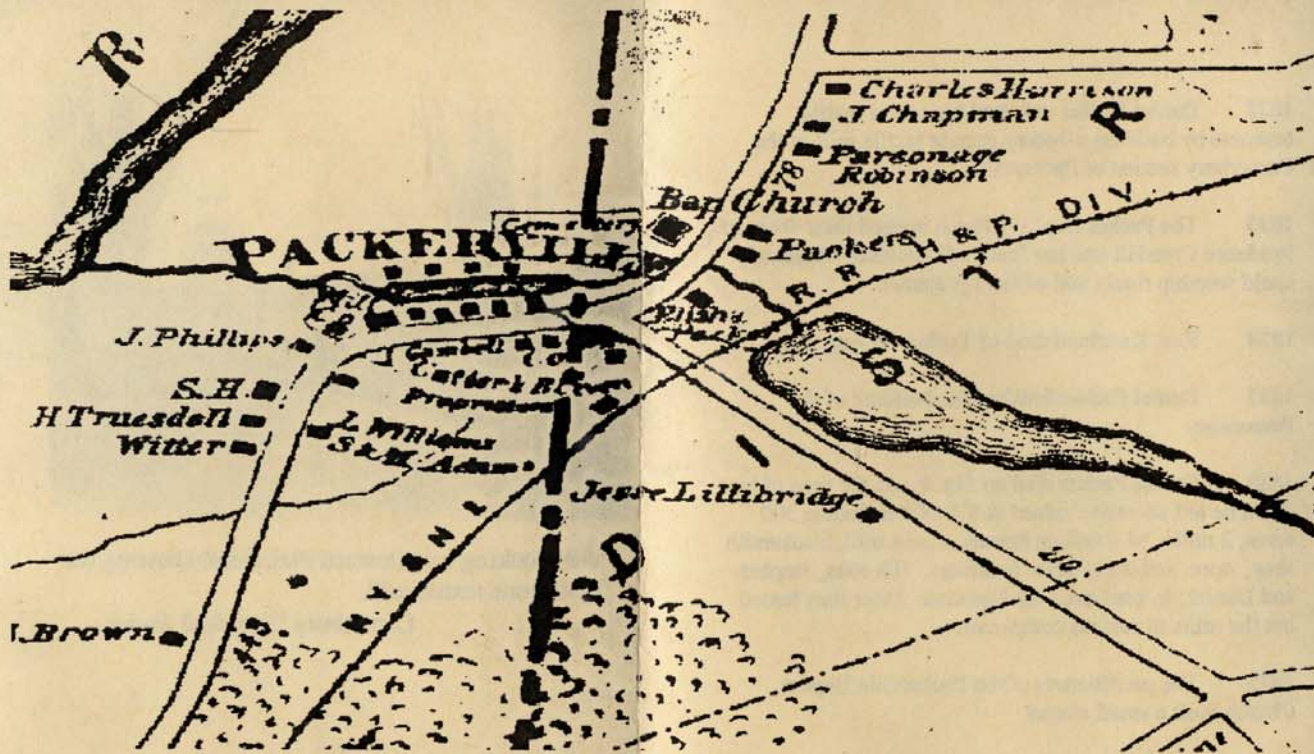
Detail from 1892 Map of Canterbury and Plainfield, showing Packerville.

"The Old Mill Wheel at Packerville, Conn." copy of an old postcard of the ruins of the wooden textile mill.