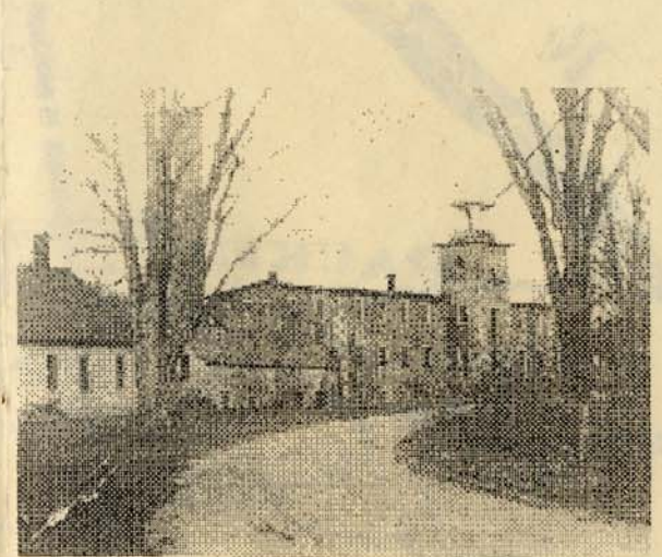
View looking east (toward Plainfield) showing the 1832 stone textile mill.