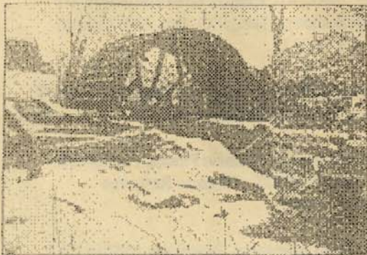
The Old Mill Wheel at Packerville, Conn.

Walking Weekend is organized by the Quinebaug-Shetucket Heritage Corridor, Inc., and the Northeast Connecticut Visitors District. Special thanks to all those people who helped make this event possible.