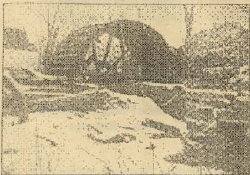
The Old Mill Wheel at Packerville, Conn.

Walking Weekend is organized by the Quinebaug-Shetucket Heritage Corridor, Inc., and the Northeast Connecticut Visitors District. Special thanks to all those people who helped make this event possible.