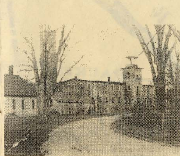
View looking east (toward Plainfield) showing the 1832 stone textile mill.