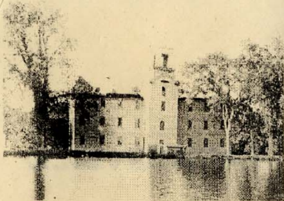
Copy of an early 1900's photo of the wooden textile mill located on the Canterbury/Plainfield town line.